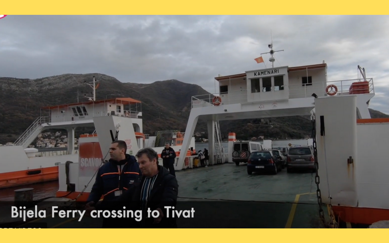
Bijela Ferry crossing to Tivat